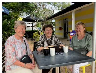
Friends of Rotary meet up for a coffee