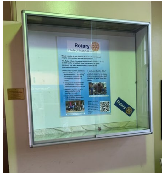
RC Ivanhoe's turn to display at the Ivanhoe Station